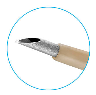
PEEK Needle/Stylet Catheter

Needle/stylet catheters are constructed of PEEK material instead of traditional PTFE to reduce the risk of fishmouthing and buckling when advancing through cirrhotic parenchyma.