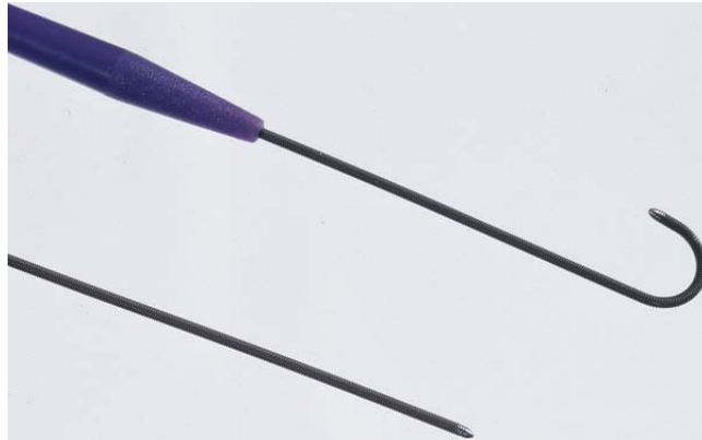
Figure 2: Drawing of Straight and J Tip Standard and Bentson Guidewires