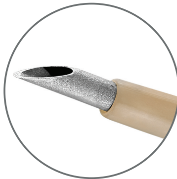
PEEK Needle/Stylet Catheter