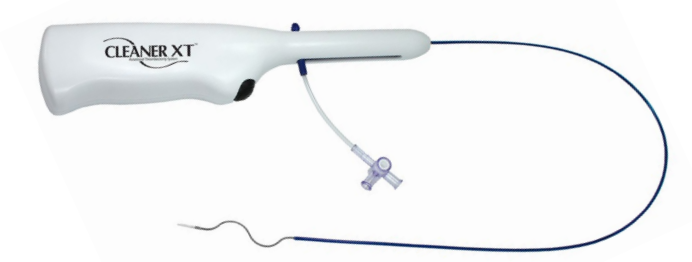
Fig 1. Cleaner XT™ Rotational Thrombectomy Device.

Research databases such as Embase (embase.com) and Research Gate (researchgate.com) were utilized for performance of initial research review. Search parameter words such as Cleaner, Cleaner XT<sup>TM</sup>, thrombectomy, complications, and patency were utilized in the search engine to identify suitable research articles discussing the used of mechanical rotational thrombectomy utilization in the dialysis access circuit. Once appropriate studies were identified, initial data was scrubbed to identify the studies that included post procedure patency rates, procedural times, and cited procedural or post procedural complication data. Four studies stood out with regards to having all the parameters for evaluations after data scrub was performed for comparative benchmarks.